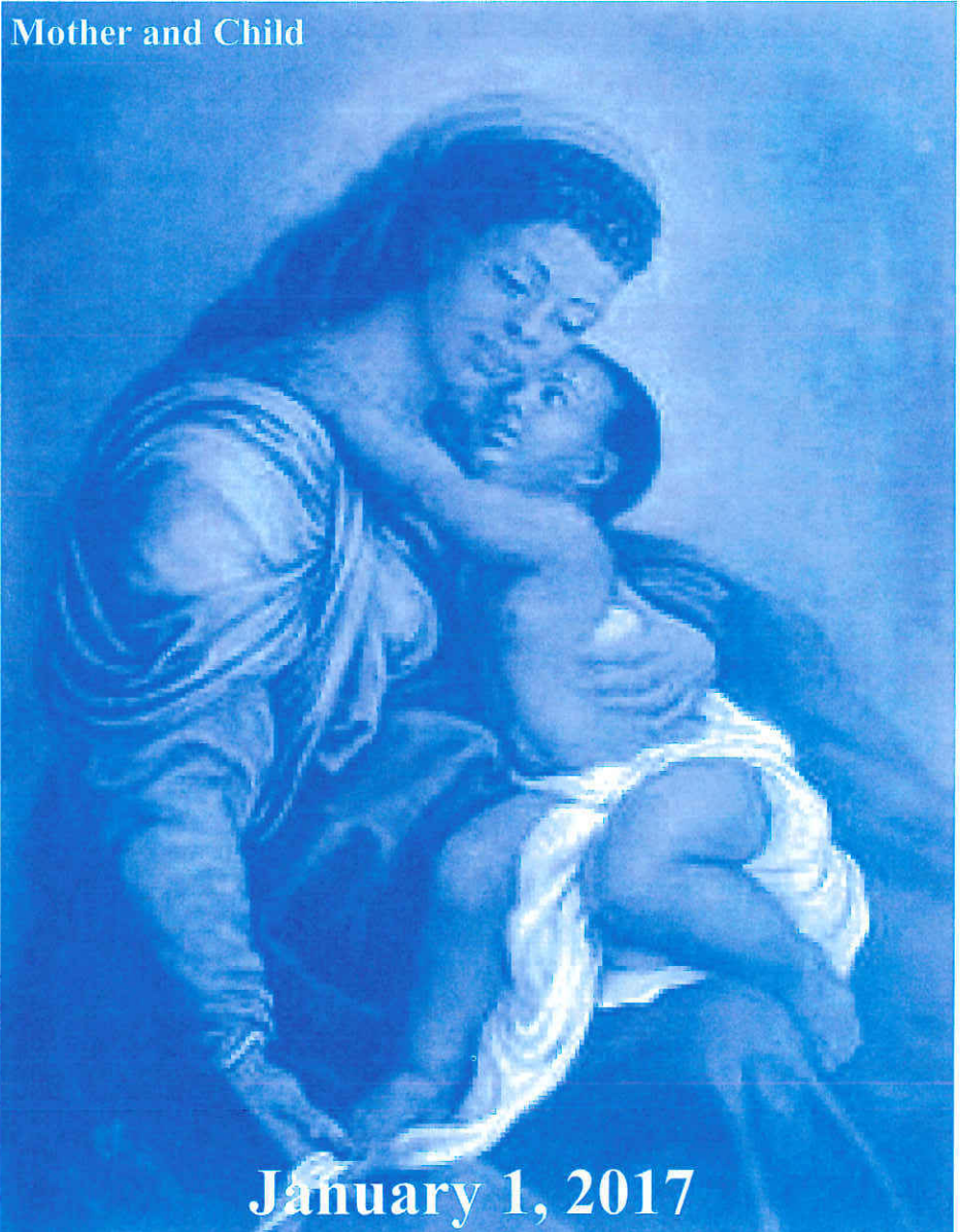
Mother and Child