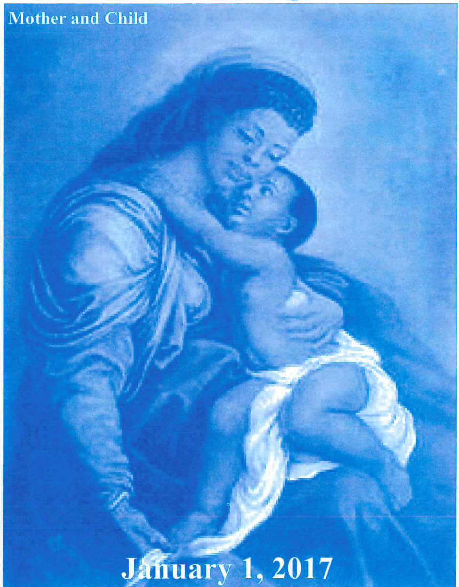
Mother and Child